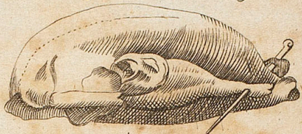
A Turkey or Fowl for Boiling