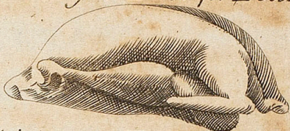
A Chicken or Fowl for Roasting