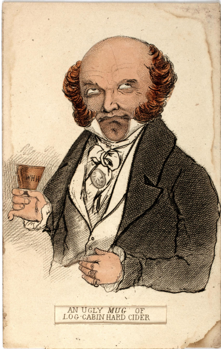
AN UGLY MUG OF LOG-CABIN HARD CIDER