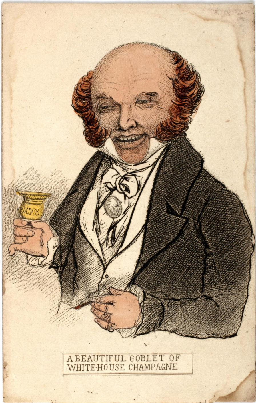
A BEAUTIFUL GOBLET OF WHITE-HOUSE CHAMPAGNE